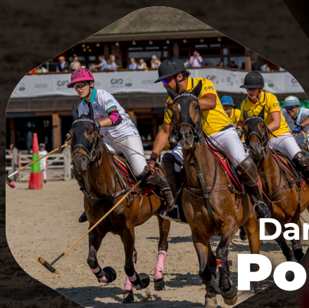
Danube Polo Club